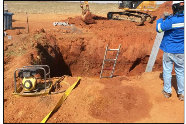
Figure 3: Pumping water out of excavated area