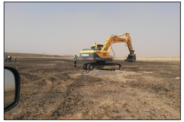
Figure 5: Excavator commencing with excavation