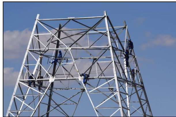
Figure 6: Tower Assembly