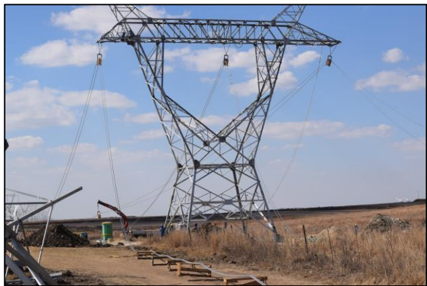
Figure 4: Stringing activities