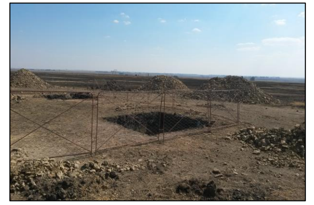
Figure 7: Fenced excavation